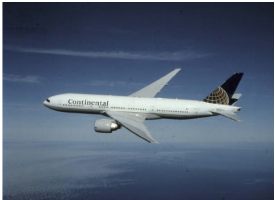
A Continental Boeing 777

Within Tech Ops, the sweet spot for innovation has centered on improving this flow of information between aviation manufacturers and the airlines, and between the airlines' engineers and its 3,500 technicians in the field. One of the most dramatic improvements of late has been the gradual switch from paper-based documentation to electronic media. The key development that made the shift to digital media possible was the creation of a set of file transfer standards known as Air Transportation Association (ATA)-2100. Through ATA-2100, manufacturers are able to identify discrete elements within a technical document—such as a part number, a heading or a graphic—and label it accordingly. This labeling—or “tagging”—converts what had essentially been a monolithic document into a reusable collection of easily identifiable data.